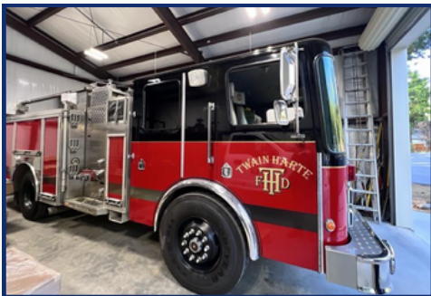
E-722 is back in service after warranty repairs.