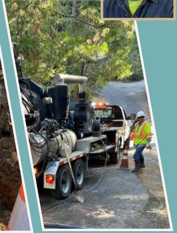
Our team working hard to repair leaks at Cedar Dr., Golf Club Dr., and Tamarack Dr.