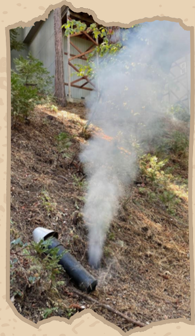
Shadybrook Dam repairs, Garden Exchange Club tour, sewer collections smoke testing.